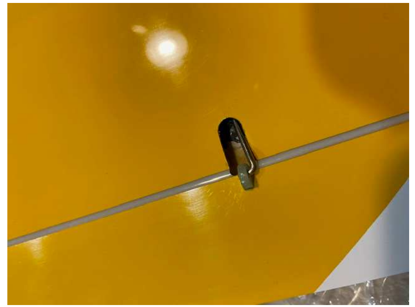
Control horn exit needs to be 12mm long x 6mm wide for smooth operation

The servo needs to be connected to the control rod before it is epoxied in place as there is no chance of fitting it afterwards. I lined the wing with masking tape before I started to protect the surface: