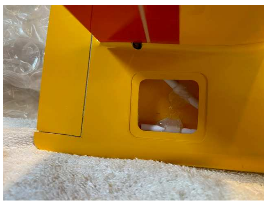
Snakes held with hot-glue where they touch. Voltage regulator fits forward of the hatch with extended wires to battery and RX

The Rudder horn is pre-fitted (thanks James) and is a simple case of making up the snake and fitting it.