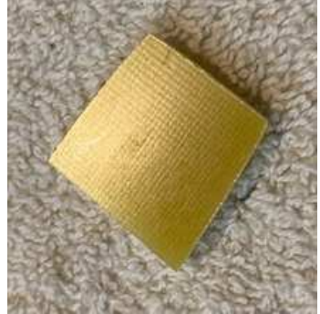
Plates for RX and rear of battery to sit on, retained with Velcro