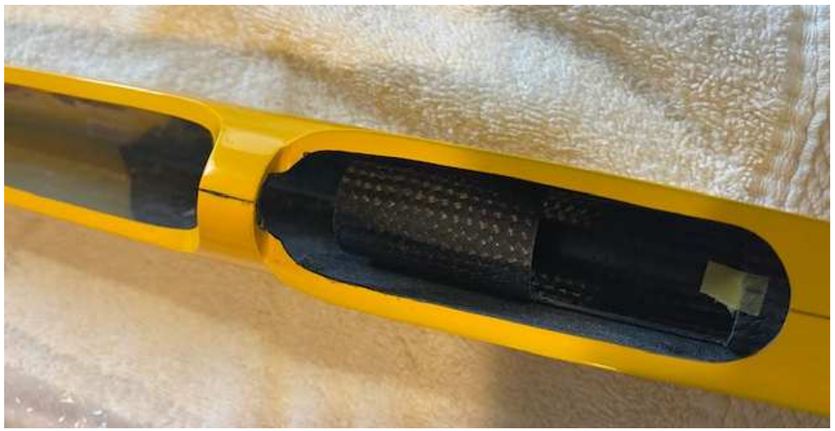
Ballast tube in place. Note the centre of the tube is aligned to 80mm from Wing Leading Edge

Note: the tapered end of the ballast tube fits well in the fuselage, so remove material from the opposite end and cap with some 3mm epoxy fibre glass sheet. This has the added benefit of moving the opening forward making ballast additions easier. Remember to make the centre of the ballast tube and align it 80mm from the wing leading edge, and epoxy in position. Check that your chosen control runs pass the tube without interference.