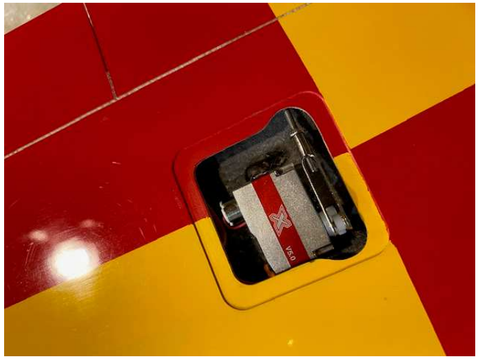
Completed servo installation. Repeat four times

Before activating the servos, I turned the throws down to 10% and worked my way up to the correct settings to remove the risk of damage to servo or wing.