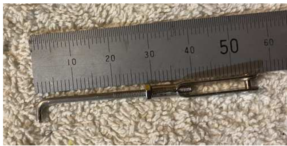
Set control rod to 53mm long before installation

I found having the servo powered really helped. Sequence: