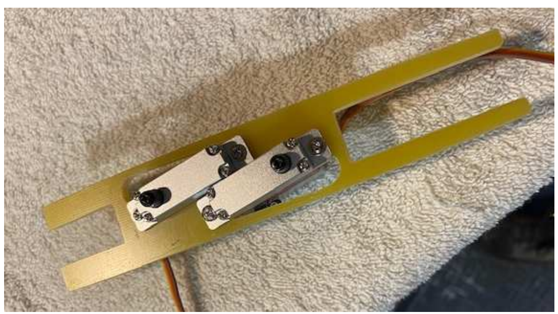
Servo tray with servos. Remove servos before fitting

Canting the servos at an angle as shown brings the output shaft close to the centre line and creates clearance for the output arms either side. KST servo wires exit via a tough gromit, so the tray is designed to insert the servo from above, then twist into position before fitting the screws.