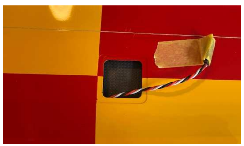
Retain servo connectors with tape to protect wing

You will need servos that are a maximum of 8mm thick. I used KST X08H Plus, de-lugged to allow positioning forward in the servo bay right next to the sine-spar. I went through I number of ideas to link the servo to the control surface, and settled on a simple bent control rod with an M2 metal clevis with a lock-nut.