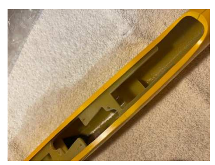
Plates and Servo tray epoxied into the fuselage