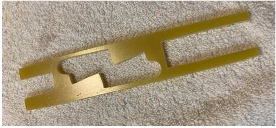
Servo tray cut and trimmed to fit

In my layout I have Rudder and Elevator servos mounted in the radio bay, a 1300mAh 2S LiPo up front, and a Jeti REX7 RX behind. The tray is made from 3mm epoxy fibre glass sheet and epoxied in place once all the fitting and shaping is complete. Basic design is shown: