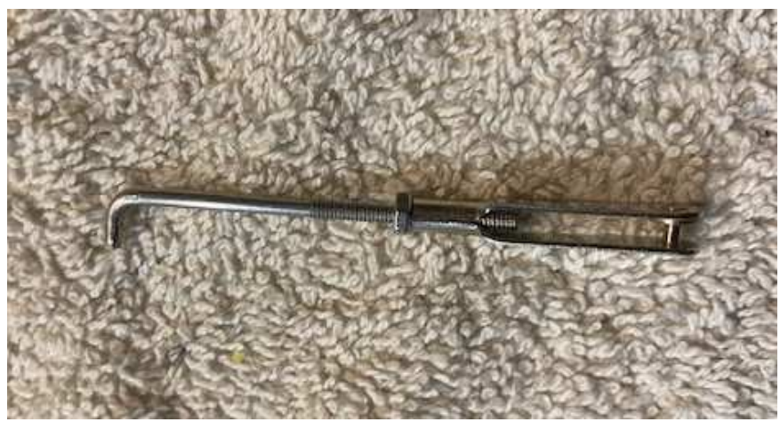
2mm diameter control rod with metal clevis and lock-nut

The bay needs relieving for the rod to pass freely, and to clear the output arm. You are aiming for the connected servo to sit flat against the inner wing surface with no load applied; this is important for when the servo is glued in place: