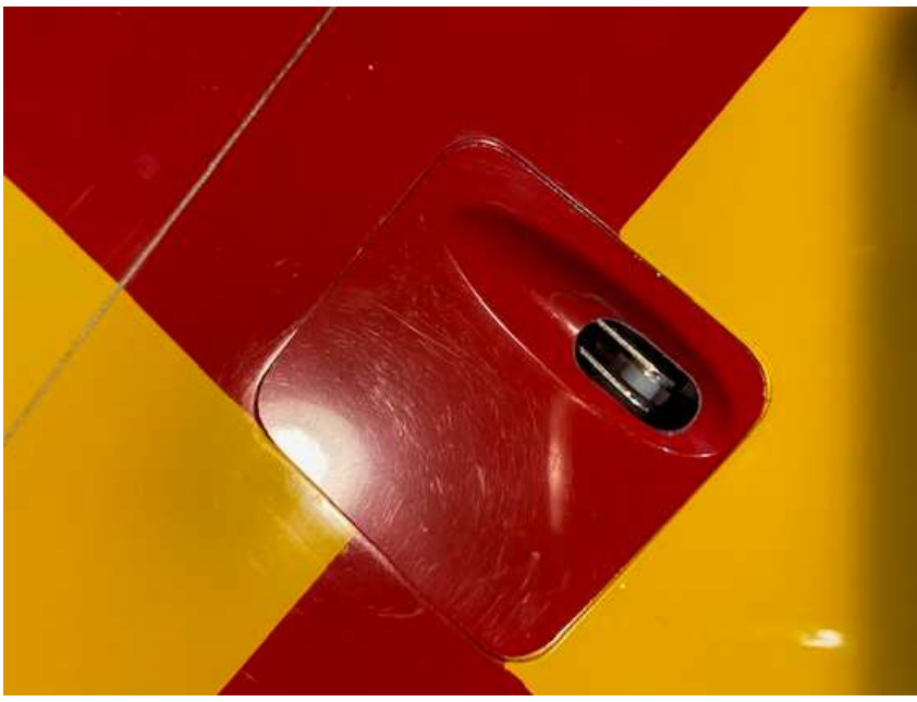
Relieved servo cover

I found with the servo output arm needed to gain full surface movement, and a clean run between servo and surface, the servo cover blister isn't quite deep enough. Another 3 to 4mm and it would be fine. I therefore modified the covers as shown: