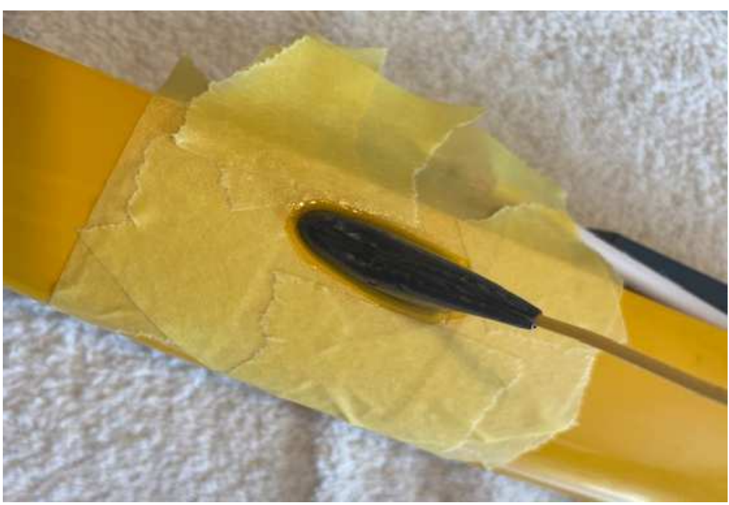
Aerial fairings in place. Masking tape prevents epoxy going where its not wanted

The radio bay is Kevlar, so the aerials don't need to protrude, but every effort should be made to get 90 degrees between them for signal diversity. However, I simply could not get the right aerial runs, so used fairings and routed them externally.