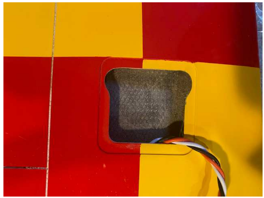
Relieve servo hatch as shown to allow free movement of control rod and output arm. Note that the relief is in-line with the control horn

The bay needs relieving for the rod to pass freely, and to clear the output arm. You are aiming for the connected servo to sit flat against the inner wing surface with no load applied; this is important for when the servo is glued in place: