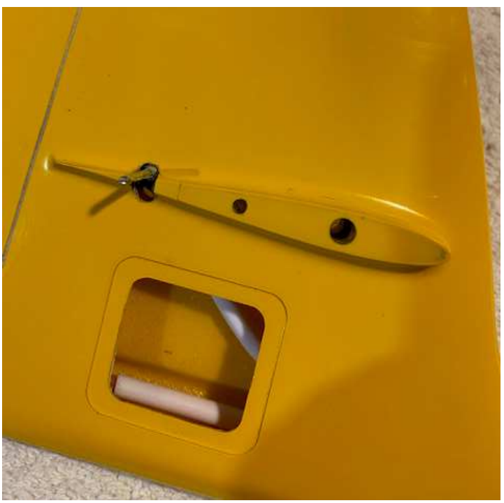
Elevator slot with Rudder and Elevator snakes in position

angle of around 30 to 45 degrees from vertical. The added benefit is less curve on the snake. A slot for the elevator joiner needs to be made, which is challenging because of the thickness changes in that area. It takes a little fiddling to get it right before applying hot glue where snake outer touches the fuselage. Continually check free movement as you go.