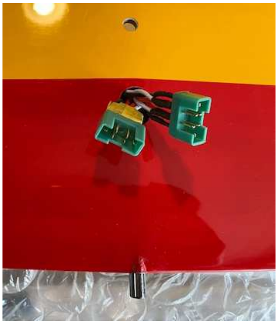
Wing Harness exit - hole must be enloarged