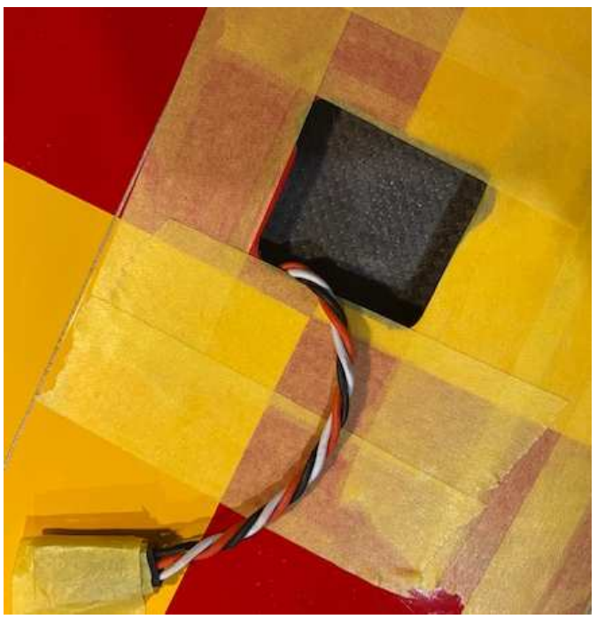
Mask wing to stop epoxy finger prints

The servo needs to be connected to the control rod before it is epoxied in place as there is no chance of fitting it afterwards. I lined the wing with masking tape before I started to protect the surface: