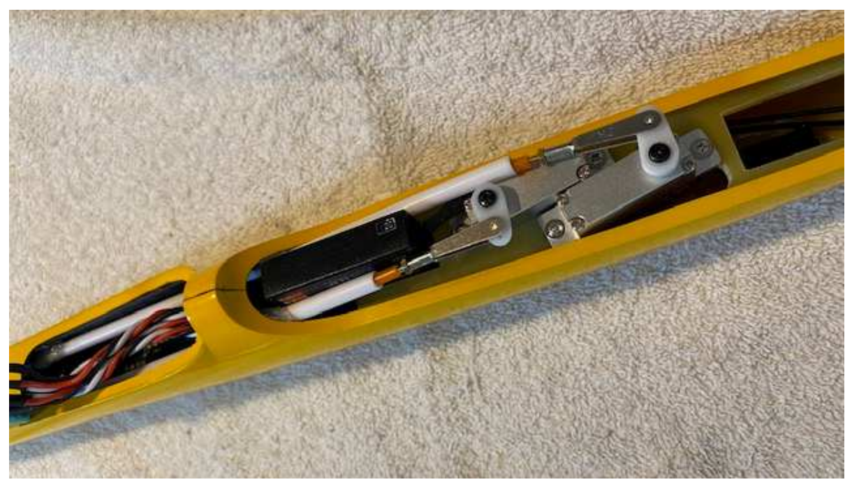
Servos installed and connected with RX in place

If Dynamic soaring or racing, you can either fit a micro servo in the vertical stabiliser, or use a 3mm carbon push rod. Have fun connecting a push rod as the run is impeded by the ballast tube. I found when setting the balance point, that I needed to move the voltage regulator to the rear to create enough space in the nose for the lead (3 ¼ ounces, 90g). High voltage servos would've helped by negating the need for the regulator – lesson learned.