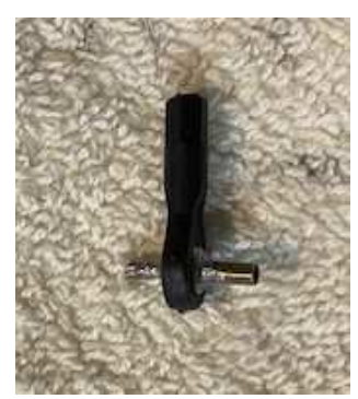
Soldered Brass Tube

The supplier ball joint has a 2mm hole and can easily be sleeved using 2mm x .225mm brass tube soldered in place, and trimmed as shown: