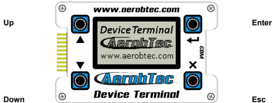
Fig. 3: Buttons

Up and Down move in one menu and change value. Enter activates a submenu and confirms a new value. Esc leaves a submenu and discards a changed value.