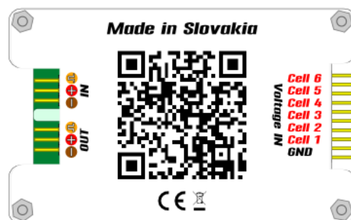
Fig. 1: Connectors

There are four connectors on the Device Terminal